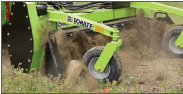
Great for land use preparation