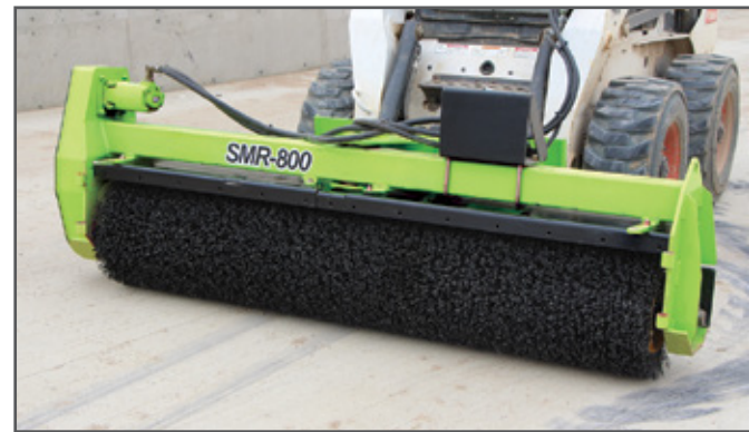
Optional broom attachment for sweeping parking lots, roads or removing snow