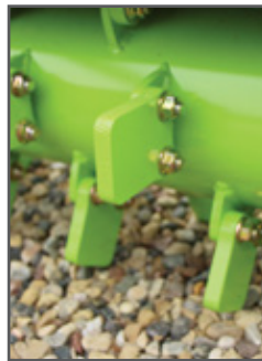
Replaceable teeth 4" & 2 1/2"