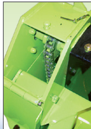
Fully enclosed final drive chain