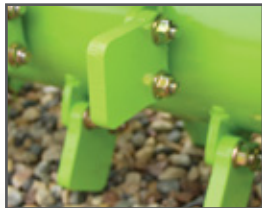
Replaceable teeth 4" & 2 1/2"