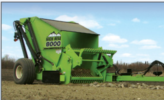
High Rise 8000