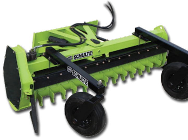
Standard Mount Shown

Available in Cat III hitch for smaller hp tractors.