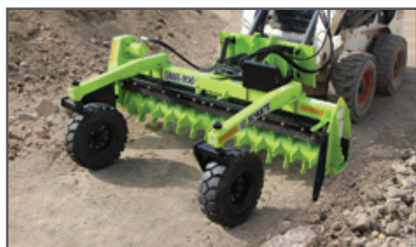
Excellent for land preparation

High speed sprocket for optional gravel reclamation configuration