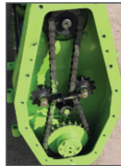
Gearbox features reversible tensioner and heavy 80 chain which decreases downtime.