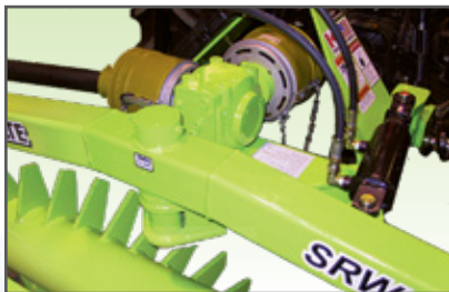
Heavy duty PTO driveline