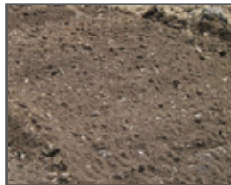
After Multi Rake use