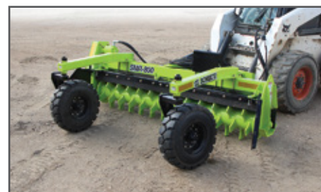
Legendary Schulte quality