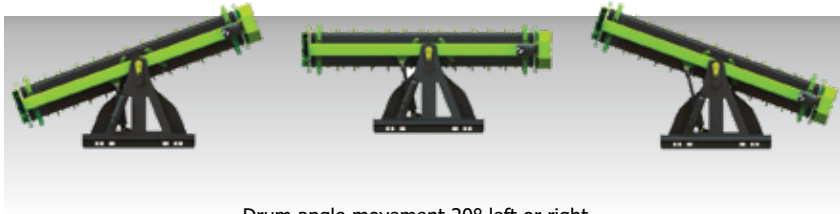
Drum angle movement 20° left or right